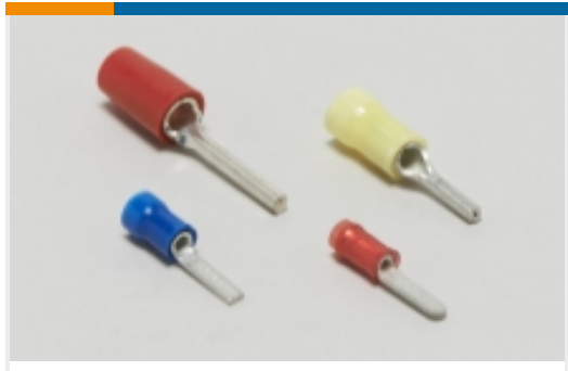
Crimp Wire Pins, Tabs & Ferrules(25)