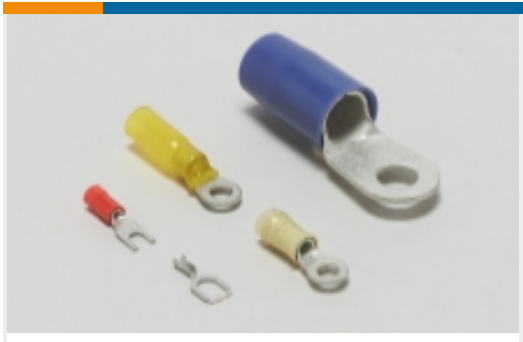
Ring Terminals & Spade Terminals(537)